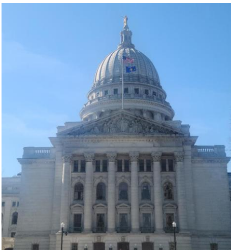
Flag flown over the state capitol on 3/11/24 honoring SK Dave Bormett.